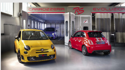
Abarth 595 Competition & Abarth 695 Tributo Ferrari by RS Evoluzione from Italy, Torino