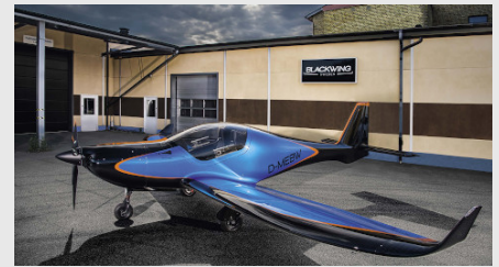
Blackwing BW 635 RG from the Swedish Eslöv of Blackwing