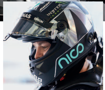
The helmet of the 2016 FIA Formula One™ World Drivers' Champion, Nico Rosberg.