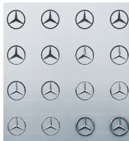
Some of the stages in the 30-step process required to airbrush the iconic Mercedes-Benz star.