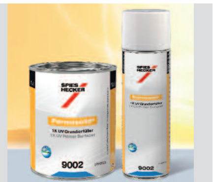
Permasolid® 1K UV Primer 9002 is an efficient solution for small damage repairs.

The transparent grey primer surfacer is applied in two light spray passes without flash-off times. With the help of a 400 watt UV-A lamp, it dries within just three to six minutes. It is also suitable for use with more powerful, commercial UV-A lamps. The primer can be dry- and wet-sanded and overcoated with all Spies Hecker basecoats and topcoats.