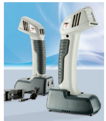
The new ColorSpot daylight lamp with LED technology.

the LEDs, the battery can handle a long day's work. Thanks to its minimal weight and ergonomic shape, ColorSpot is comfortable to handle and helps to make refinishers' work easier," Wegener adds.